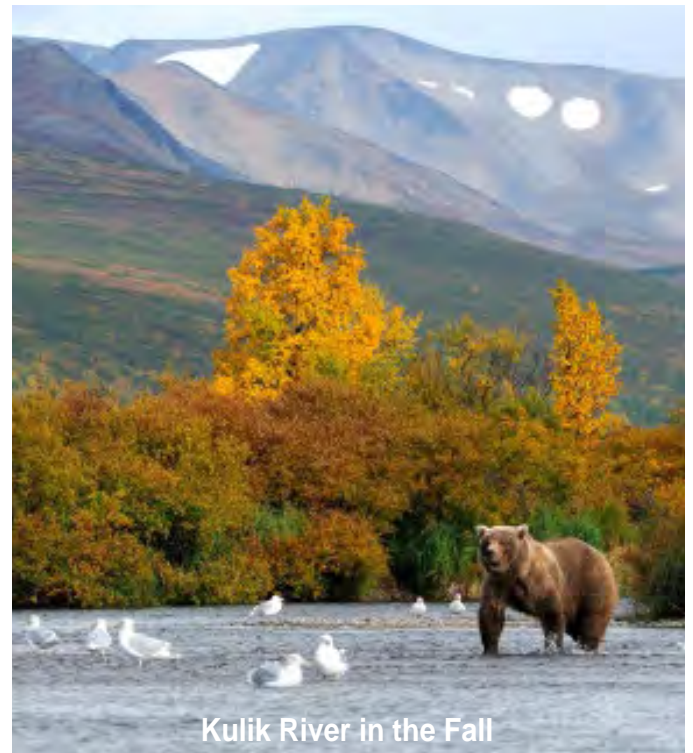
Kulik River in the Fall